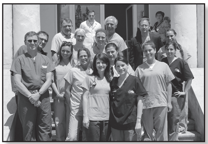
HFT volunteers in Armenia