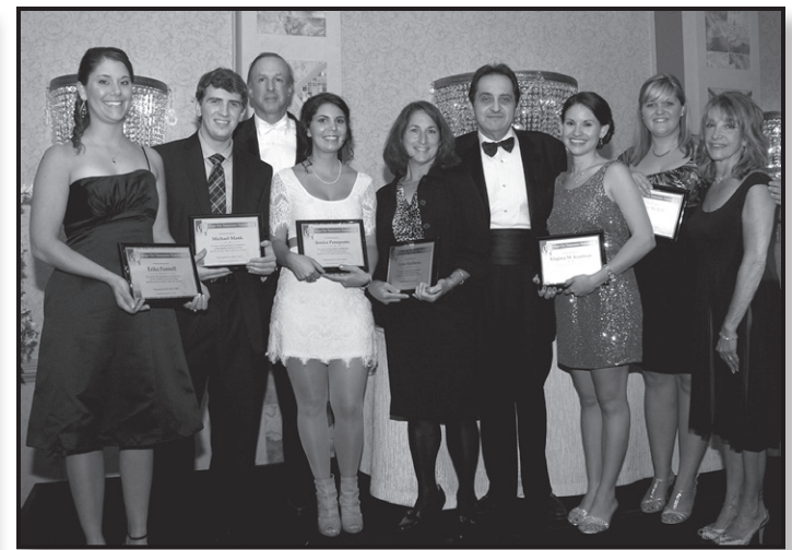
HFT Student Trip Volunteers along with HFT Board Members